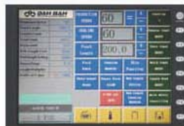
▪ Touch-screen makes operation easier and faster