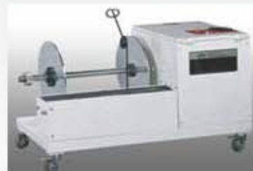
▪ Trim rewriter