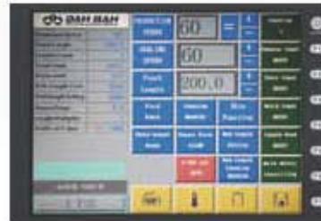
▪ Touch-screen makes operation easier and faster