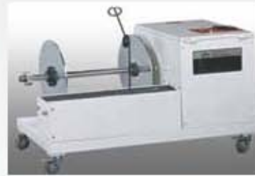
▪ Trim rewriter